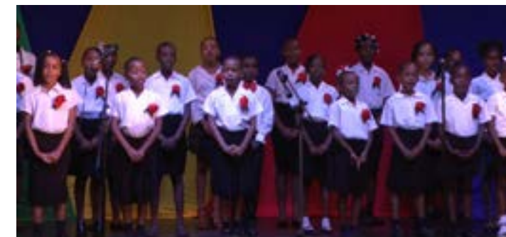
Clare Valley Government School