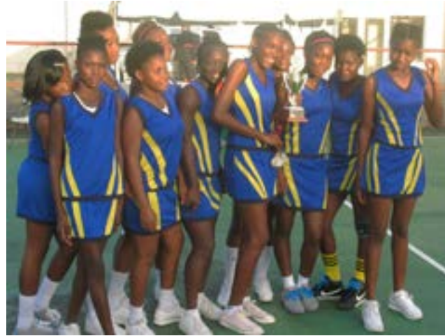
Junior 1st Place - Central Leeward Secondary School