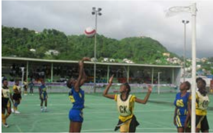
Junior finals - Central Leeward Secondary School vs. Bethel High School