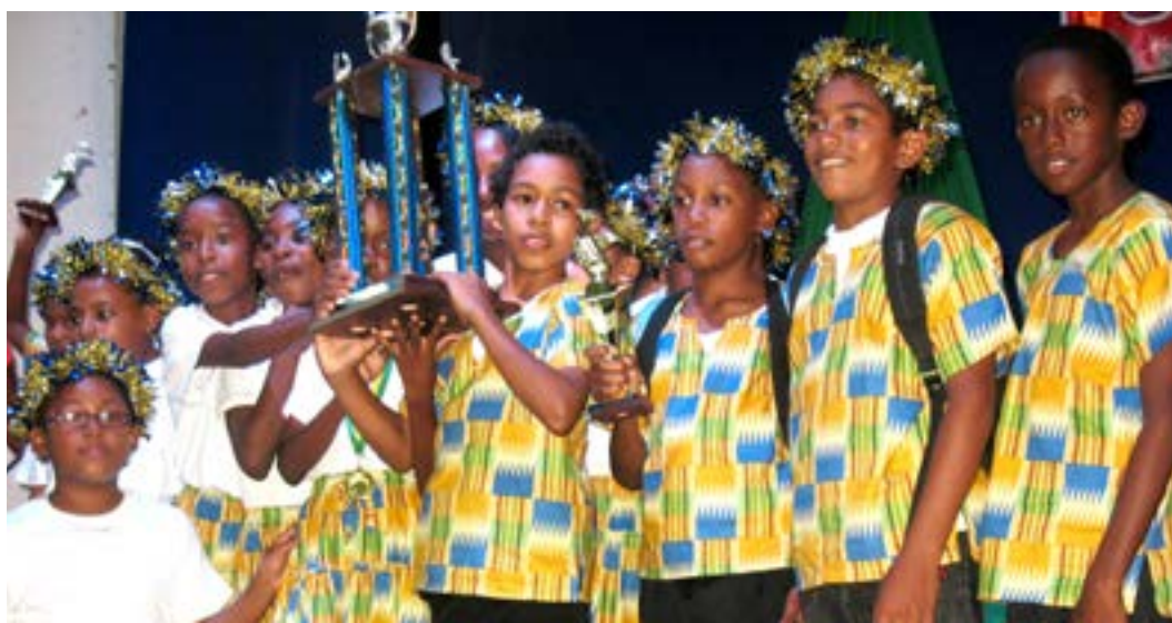
Sandy Bay Primary School - Winners of the 2014 Christmas Music Festival

The Sandy Bay Primary School was awarded the challenge trophy when the curtains came down on the 2014 edition of Christmas Music Festival.