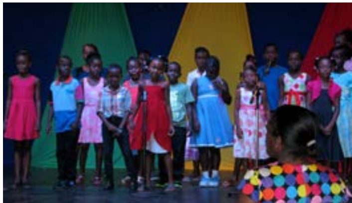
Belair Government School in the Calliaqua Zone