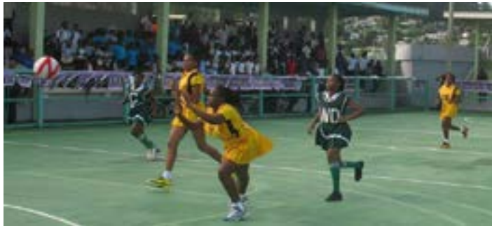
Senior finals - Emmanuel High School Mesopotamia vs. Bethel High School