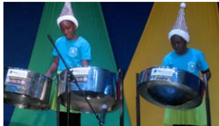
South Rivers Methodist School in the Union Zone

The most outstanding instrumental performance was a steel pan duet delivered by the South Rivers Methodist School. The award for most outstanding chorale speech went to the New Prospect Primary School.