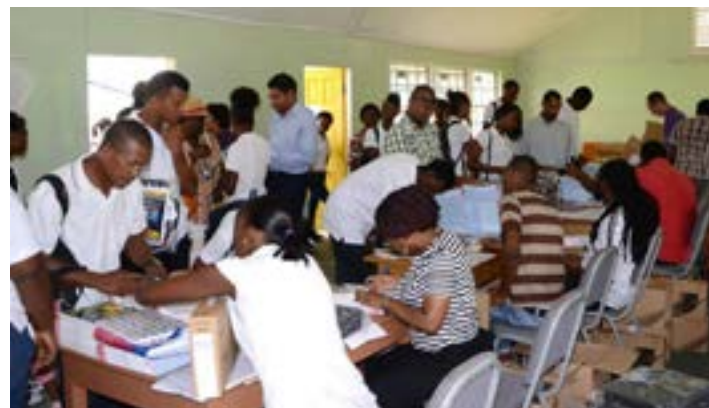
Parents and student collecting the One Laptop per Student package

smoothly and thanks all involved for their contribution to the project. She says: "Proper use of the laptops by the students should enhance their skills in information literacy, Internet research and presentation... the laptops have come at the right time for the college students, as they are preparing for their advanced level proficiency exams". Ramsamooj has urged the students to use the tools effectively, in order to enhance their learning outcomes.