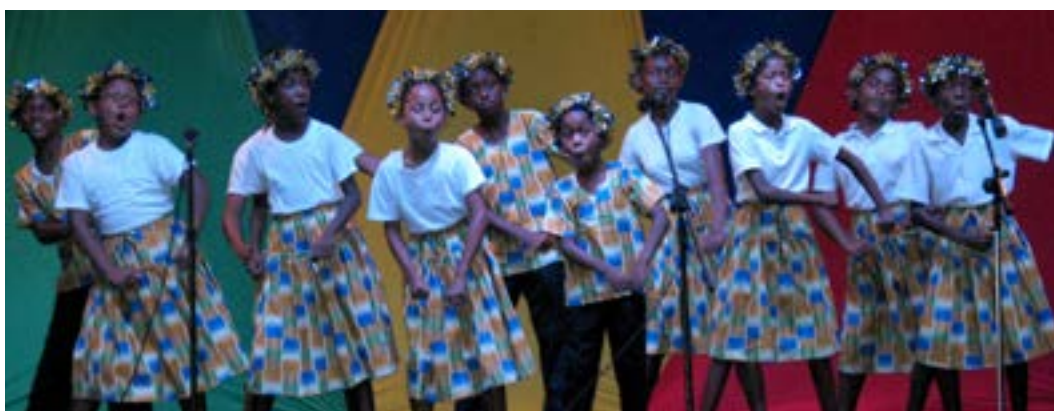
Sandy Bay Primary School in the Georgetown Zone

Zonal awards were also distributed and the winning schools in this category are: