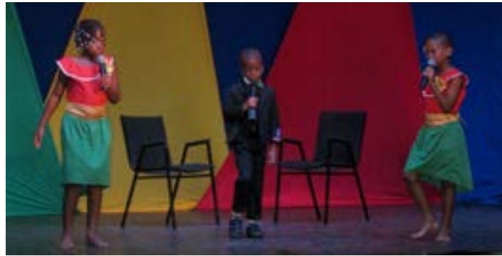
Bequia Anglican Primary School in the Bequia Zone