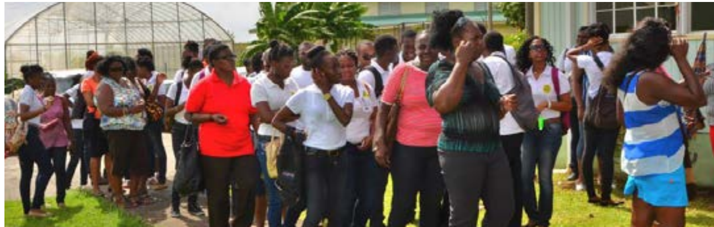
Distribution of Laptops to SVGCC (Division of Technical & Vocational Education)

First year students of St. Vincent and the Grenadines Community College - Division of Arts, Sciences and General Studies, Teacher Education, and Technical and Vocational Education have received their laptops under the One Laptop per Student project. Details of the distribution follow: