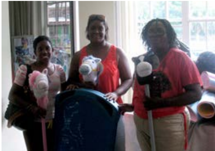
Church of God preschool, Spring Village - one of the beneficiaries of the donation

Due to the adverse effects of the 2014 Christmas Eve floods, the aforementioned donors have provided a variety of items to aid affected children in the resettlement process.