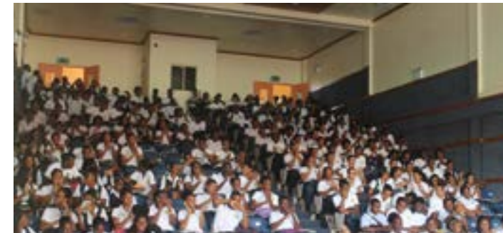
Students at SVGCC, Villa Campus

Payments commenced on Friday 7th November and continued to Friday 21st November.