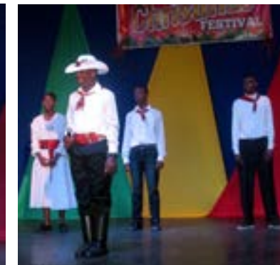
School for Children with Special Needs Kingstown