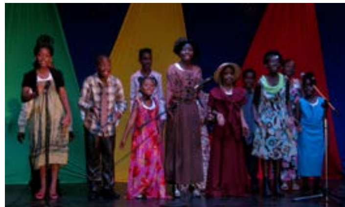
New Prospect Primary in the Marriacqua Zone

The most outstanding instrumental performance was a steel pan duet delivered by the South Rivers Methodist School. The award for most outstanding chorale speech went to the New Prospect Primary School.