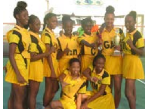
Senior 1st Place - GTM Bethel High School