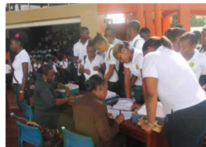
SVGCC students receiving their awards

The Ministry of Education hosted a special ceremony at the Villa campus of the St. Vincent and the Grenadines Community College to present bursaries to eligible students. Prime Minister, Dr. Ralph Gonsalves, presented the bursaries of EC $500 to students who met the criteria in the Caribbean Secondary Education Certificate (CSEC), the Caribbean Advanced Proficiency Exam (CAPE) and the Cambridge Education Advanced Level exam.