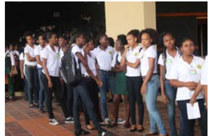
SVGCC Students receiving their EC $500

• 5 CSEC passes or more, including English Language and Mathematics