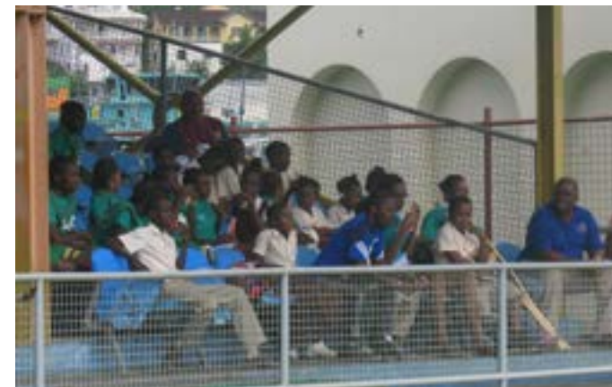
Spectators at the 2014 Netball finals

The Arnos Vale Sporting Complex was lit up when the 2014 Inter-Secondary Schools' Tournament and the Primary Schools' Netball Festival culminated with some exciting games, followed by an awards ceremony on Friday 21st November.