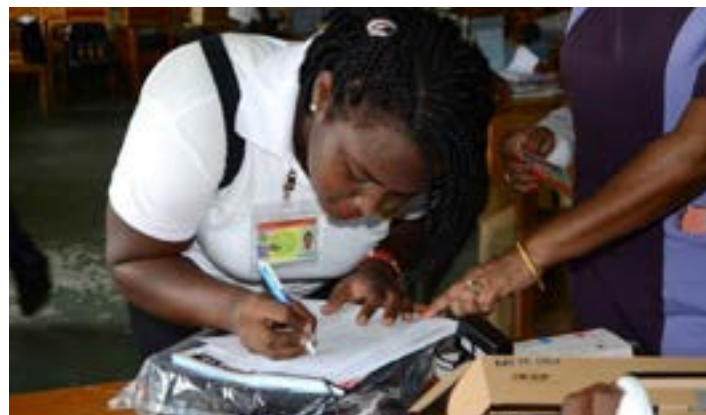
Student signing contract before receiving laptop and carrying bag

Division of Arts, Sciences and General Studies - 512 Division of Technical and Vocational Education - 400 Division of Teacher Education - 77