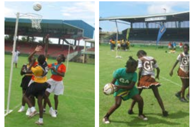
Primary Schools preliminaries round

Langley Park Government School Cane End Government School Questelles Government School Layou Government School Barrouallie Government School Sandy Bay Government School Richland Park Government School Buccament Government School