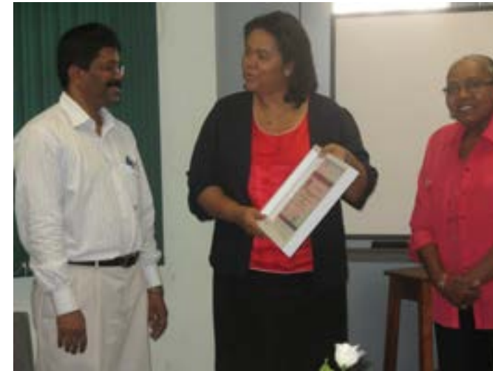
The American University of St. Vincent accepting their certificate of registration from the Permanent Secretary of the Ministry of Education.

The American University of St. Vincent (AUS) has been issued a certificate of registration, after meeting the required standards.