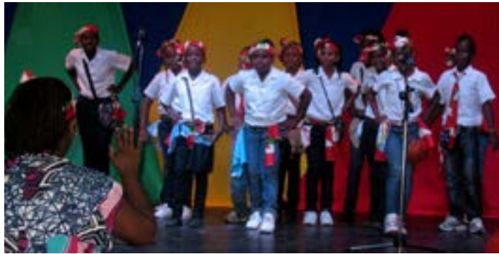
Kingstown Prep School in the Kingstown Zone