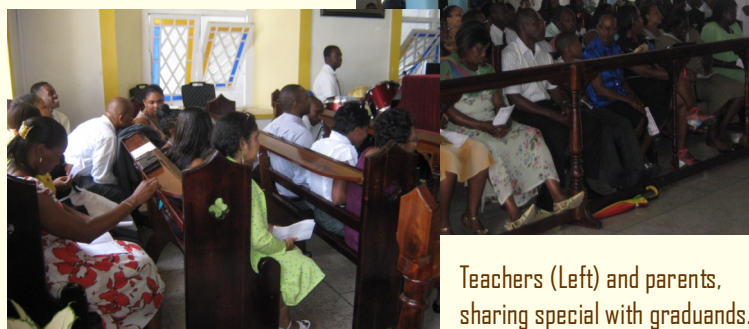
Teachers (Left) and parents, sharing special with graduands.