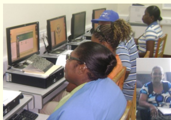
Participants at Productivity Tools and Computer Maintenance

The three day workshop – Productivity Tools is geared towards providing training that will eventually build a capacity for distributed and online learning in St. Vincent. In order to achieve this goal, some of the workshops will be offered in a blended format so that educators see online learning from the learner's perspective and gain an understanding of the challenges and opportunities of that delivery mode. Teachers were taught how to use Microsoft Office applications to enhance their teaching and to improve their students learning capacity within the classroom environment.