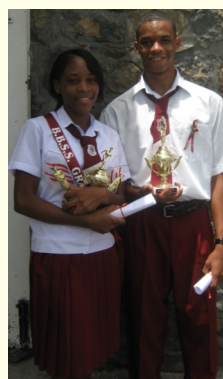
All smiles for reaching thus far.