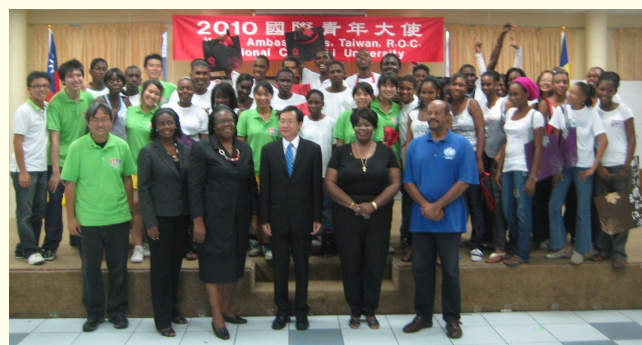
All participants in Cultural Extravaganza at closing ceremony.

taking courses in: computer programmes used in Taiwan; Chinese traditional dance embedded in Taiwanese culture; commerce knowledge; physical education featuring taekwondo and cheerleading as well as culture courses inclusive of a song and food exchange, among other things. Similarly, the Taiwanese youths were taught how to play the steel pan and were schooled in SVG traditional dance. The visitors also spent some of their time on sightseeing adventures and on Thursday 18 July, 2010 they were treated to cocktail at the Prime Minister's Residence.