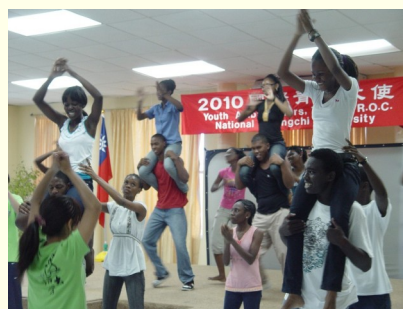
Students of the Community College with the Taiwanese delegation performing a cheerleading routine.

By Friday July 23, 2010 the youth ambassadors of both countries were so versed in each other's culture that they were able to put together a very entertaining exhibition package at the Methodist Church Hall. Members of the public had an opportunity to witness the Vincentian youths