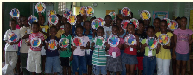
Children at KIND Camp in Marriaqua

This year the programme was however expanded to the Barrouallie and Marriaqua zones for the first time under the theme 'Learning with fun; growing with Care'. The programme in Marriaqua was run from 12 th – 30 th July and in Barrouallie from 19 th July- 6 th August. The focus was on equipping students with life skills to assist them in everyday life. The life skills courses covered topics on building positive self esteem; communication/assertiveness; decision making; human sexuality; HIV/AIDS prevention and Career Guidance among other topics. The students were also engaged in sporting activities such as softball cricket and mini tennis.