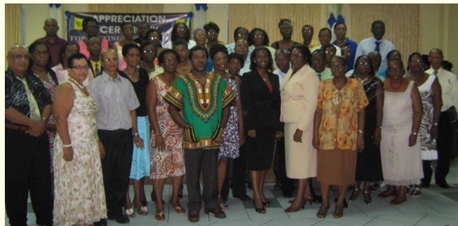
Retired & Retire Educators with Ministry of Education Officials