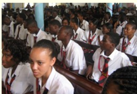
Section of the graduating class