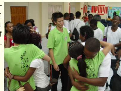
A friendship cultivated

performing pieces from Taiwan's cultural repertoire and in the same way observe the Taiwanese ambassadors eagerly demonstrate the things they had learnt from the Vincentians. The video review of the time the two groups spent together at camp was pleasantly emotive and it appears that it was a two week well spent. When shall be the reciprocal visit? A Vincentian delegation readily awaits. All hail the Ministries of Education and Culture.