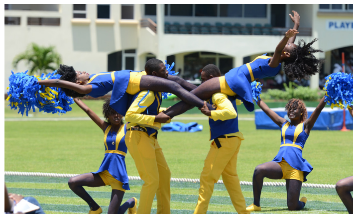
Central Leeward (Barrouallie) Secondary School