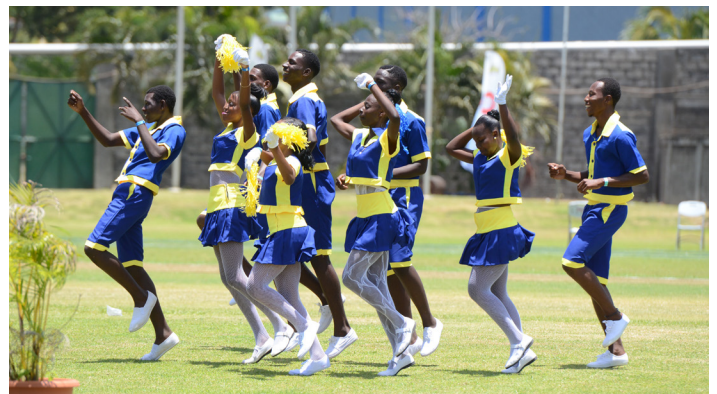
Petit Bordel Secondary School