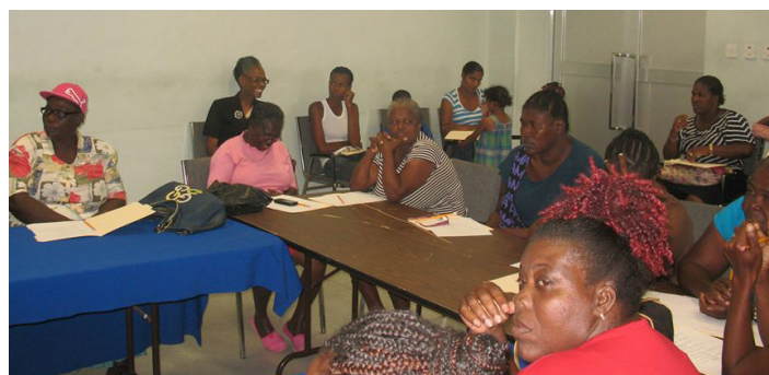
Participants - Training workshop for janitors of primary and secondary schools — at Fisheries Conference Room