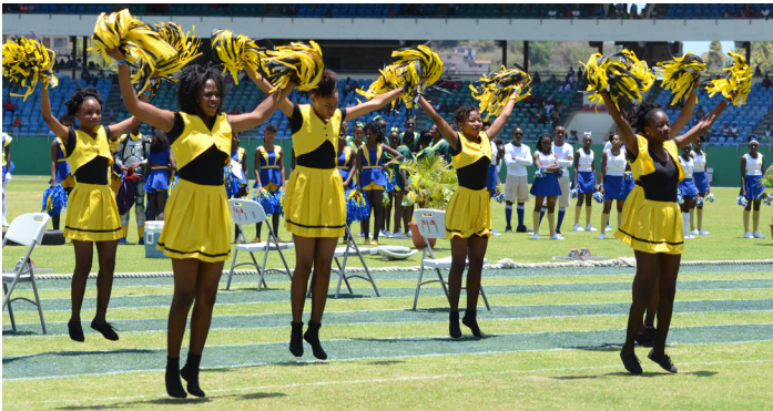
Bethel High School