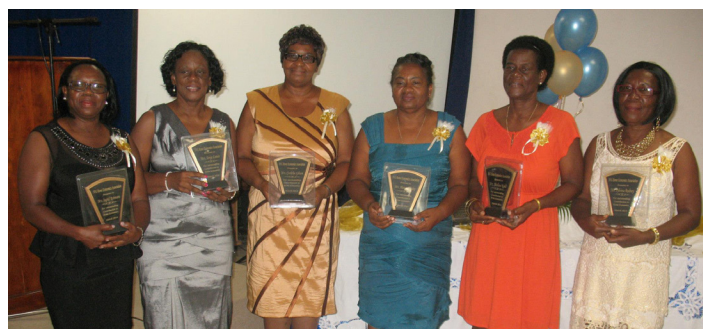
Some of the awardees at the cocktail