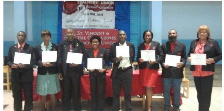
The National Executive 2014-2016

The new executive of the SVGTU was also sworn in to their respective positions: