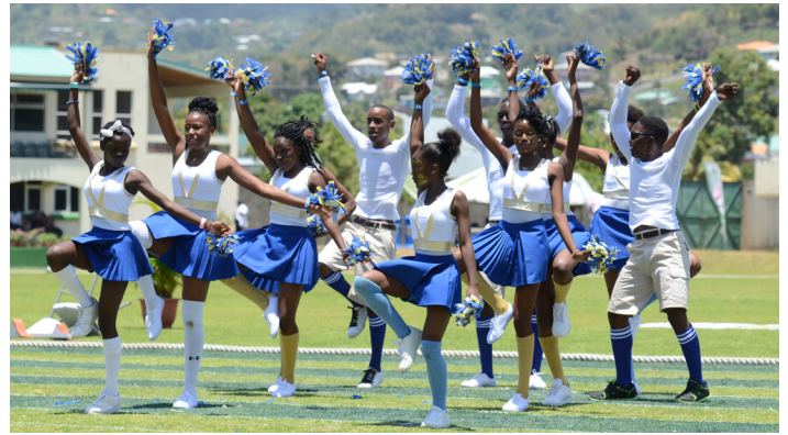
Intermediate High School

Lower / right: Primary School Children having fun with three (3) of their favourite cartoon characters.