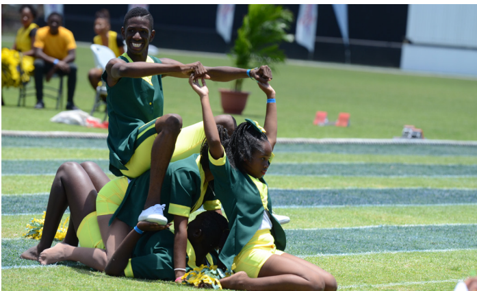
Troumaca Ontario Secondary School